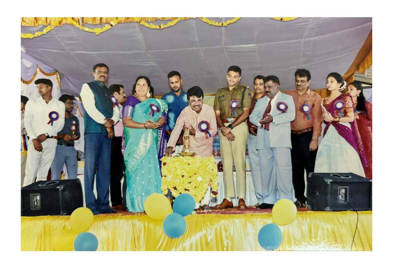
Inauguration Ceremony of Vijnana Parishath