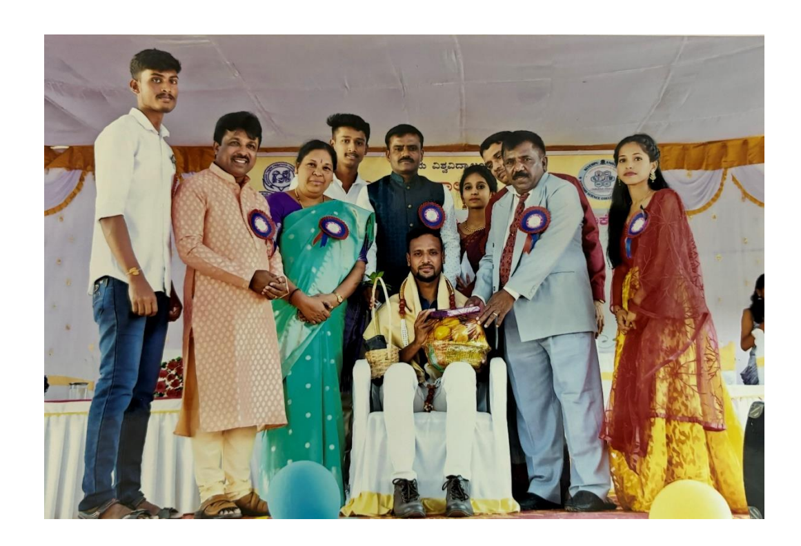
Felicitation to the Chief Guest