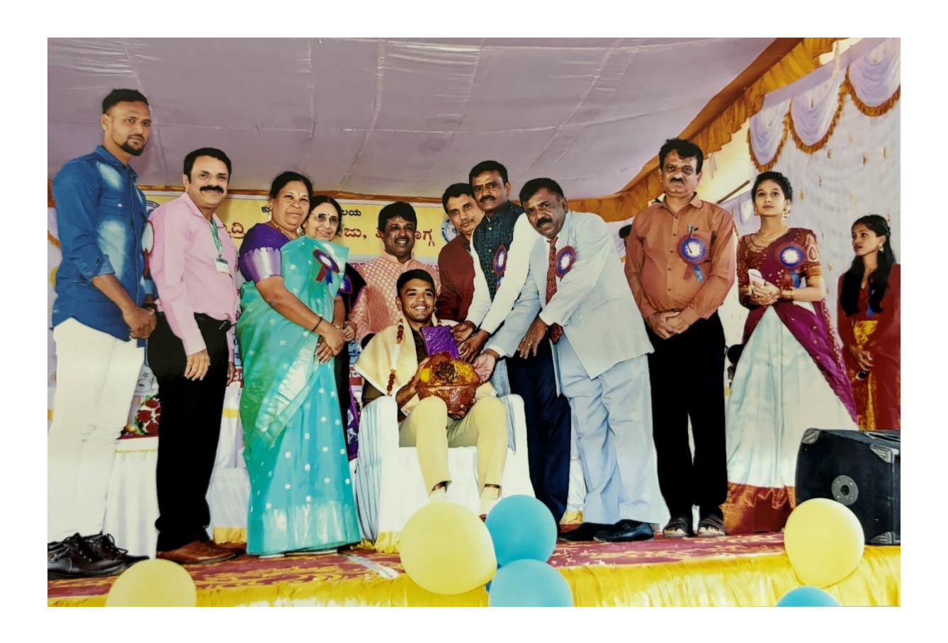
Felicitation to the Chief Guest